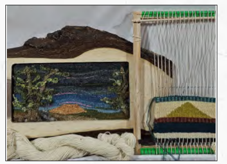
Items to bring:

Spinning wheel or spindle, scissors, darning needles, hand combs or dog combs, niddy noddy, magic marker, notebook, a kitchen fork for use as a tapestry beater and, if available, a hand steamer.