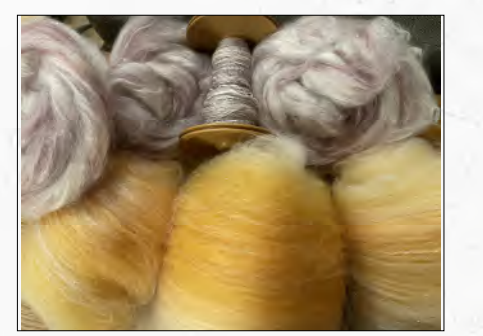
Items to bring:

Materials needed to complete independent spinning goals such as: fibre; spinning wheel (with repair kit as needed); spinning tools; 3-5 bobbins; 1-2 lazy kates; fibre prep tools; textile construction tools (knitting needles etc.); patterns and/or ideas for end use items.