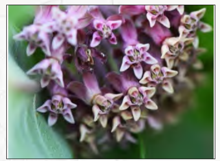
Items to bring: n/a